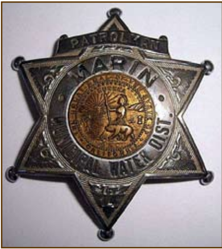
MMWD Patrolman's Badge, the Patrolman job titled was used by MMWD park rangers from 1917 until 1975