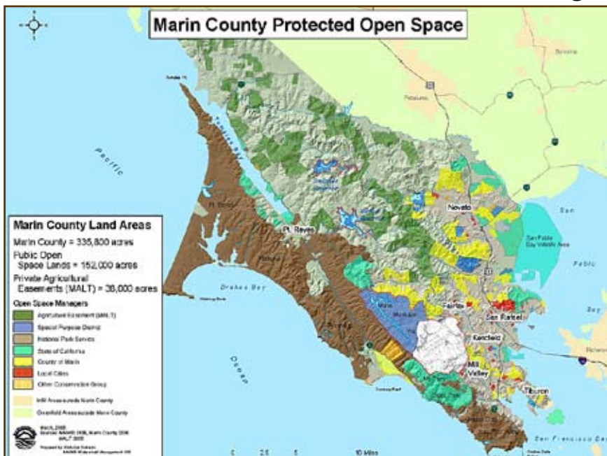
MMWD lands highlighted by red boundary, the white portion is the original 10,700 acres protected in 1917

Today, the MMWD owns nearly 22,000 acres of watershed lands, including 18,590 acres on Mount Tamalpais, that are open to the public. The lands are primarily managed to provide high quality drinking water, protect the natural and cultural resources that it is entrusted with, and provided passive recreation that is compatible with the water quality and resource protection missions. Since 2010 the MMWD has been a fully accredited POST law enforcement agency and part of FIRESCOPE, with the park rangers serving as peace officers, wildland firefighters, EMTs, Search and Rescue Specialists, and park ambassadors. MMWD also employs maintenance works, natural resource specialists, and administrative staff to protect, preserve and manage the Mount Tamalpais Watershed.