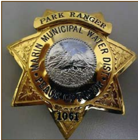
The current MMWD park ranger badge in use since 2010