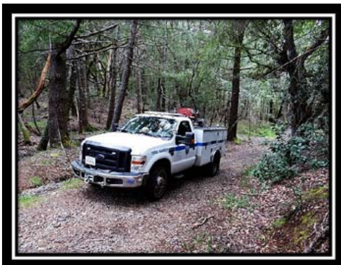
Current MMWD park ranger truck