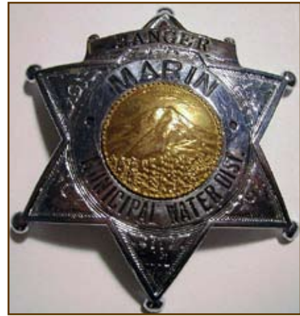
The MMWD ranger badge used from 1975 until 2010