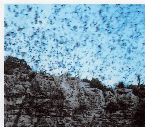
Bat flight.

After you have toured the spectacular Carlsbad Caverns, stick around for another spectacle—the evening bat flight. At dusk from early May through October, some quarter of a million Mexican free-tailed bats stream from the cave's mouth to go on their nightly hunt for insects. The bats depart in late October to winter in Mexico. Sharing the cave with the bats are cave swallows, which arrive about early March, nest in the twilight zone near the cave entrance from May or June to September, and depart at first frost in October or November. This is one of the few reliable places in the United States to see large numbers of this swallow, which first moved across the Mexican border around the turn of the century. Elsewhere in the park you can see ladder-backed woodpeckers, colorful collared lizards, which sometimes run on their hind legs, and other animals of the shrubby Chihuahuan Desert.