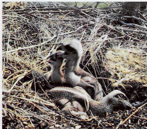
Young ospreys on a nesting platform, Naval Radio Transmitter Facility, Annapolis, Maryland. Parts of many U.S. military installations are open for wildlife watching.

The Watchable Wildlife Program is a cooperative, nationwide effort to build on the interest in wildlife to achieve a better future for it. For decades, federal, state, and private agencies and organizations have worked in their own ways to conserve wildlife. Business people are recognizing the economic potential of wildlife watching. And thoughtful individuals everywhere have seen the need to preserve our diverse biological resources both for practical reasons and for the quality of human life. All these elements of society have now joined hands under the banner of Watchable Wildlife.