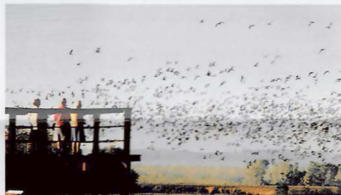
Waterfowl watching, DeSoto National Wildlife Refuge, Iowa. Since 1903, the U.S. Fish and Wildlife Service has been managing wildlife refuges throughout the nation. Today, some 330 refuges, many with trails, observation platforms, visitor centers, and other facilities, are open to the public for wildlife viewing.

Wildlife viewing opportunities are being publicized through production of state wildlife viewing guides. These are developed by state committees that select and describe many of the best sites in the state, both public and private, for viewing wildlife. The sites are picked for their wildlife, safe access, and ability to accommodate visitors without disturbance of animals or their environment. In size and configuration the sites range from a few acres to long roads or trails to entire parks, forests, refuges, or sanctuaries. Brown highway signs with a binoculars logo indicate the location of these Watchable Wildlife sites.