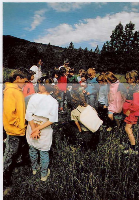
In 1988 the U.S. Forest Service started an "Eyes on Wildlife" program to promote wildlife viewing and education on national forest lands. Here, second graders learn about life along the Maclay Nature Trail in the Lolo National Forest, Montana. This national forest, in cooperation with many partners, also offers canoe and biking trails, photographic blinds, a loon auto tour, and other opportunities for enjoying wildlife.