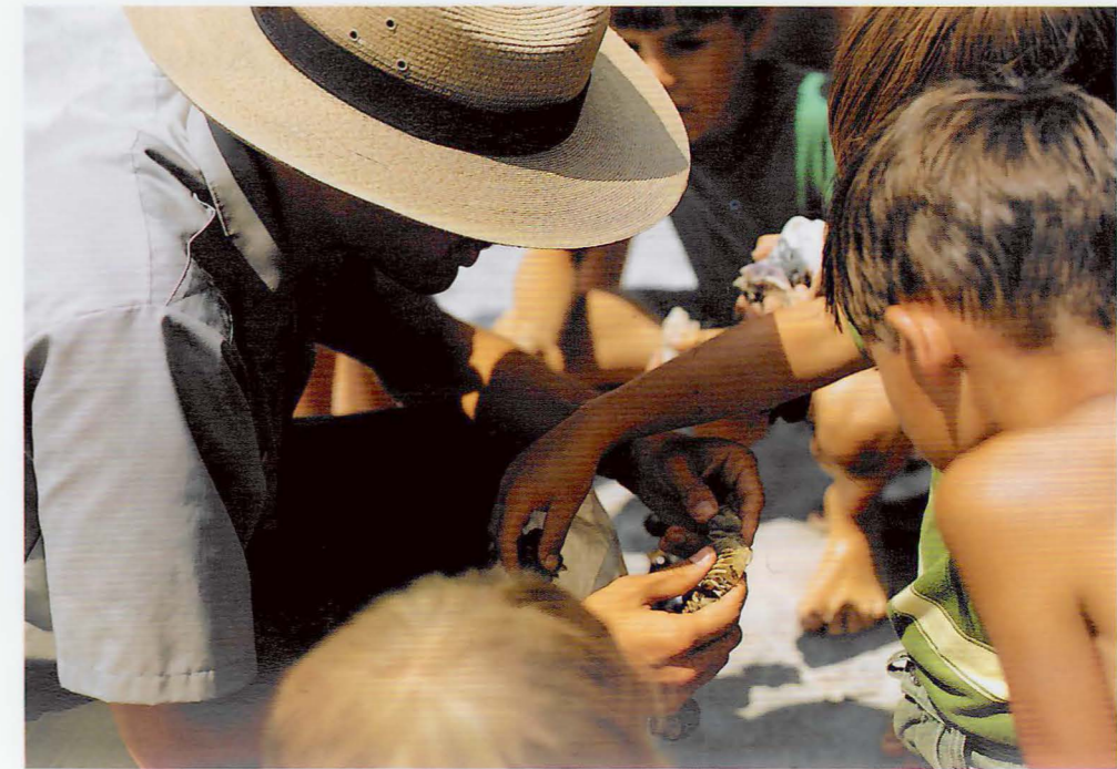
A National Park Service ranger introduces youngsters to a bit of beach life at Assateague Island National Seashore, Maryland. The NPS has programs for interpreting wildlife and its environment throughout the diverse National Park System. NPS

The ultimate goal of the Watchable Wildlife Program is to help maintain viable populations of all native animal species by building effective, well-informed public support for conservation. As we further develop our country, wildlife will be squeezed out unless we insist, individually and collectively, that wildlife in all its diversity be conserved. This means preserving some natural areas, like parks and forests, while using the rest in ways that allow an abundance of life forms to continue.