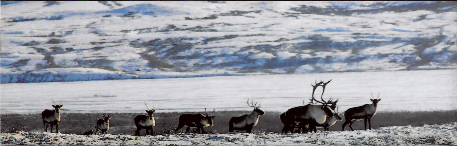
Caribou, Denali National Park

U.S. Department of the Interior National Park Service