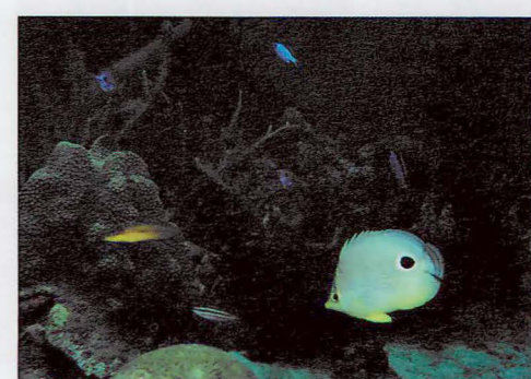
V. Small, NPS

Marine life is center stage at Virgin Islands National Park. Snorkeling over a coral reef, you can marvel at the profusion of colorful corals and fish, such as parrotfish, angelfish, and stringrays. Close inspection will reveal octopuses tucked away in their dens, with piles of shells at the entrances. Hawksbill sea turtles feed on the sponges and green sea turtles feed on the sea grass beds. Aloft, brown pelicans, magnificent frigatebirds, and terns enliven the sky. Ashore, where tropical dry and moist forests predominate, you are sure to see the tiny black, yellow, and white bananaquit, and more than likely the iridescent Antillean crested hummingbird.