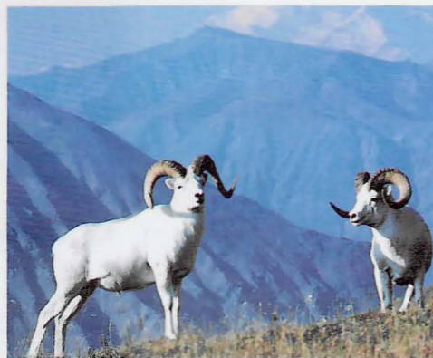
Danny On, NPS

The grandeur of Denali is staggering. Forested valleys sweep up to the tundra, snow, and glaciers of high mountains, topped by North America's highest peak. Here you have a panoramic stage for some of North America's most exciting wildlife watching. A trip along the 90-mile park road aboard the free shuttle or concession-operated buses (the only access to the interior of the park) is likely to show you grizzly bears, caribou, and Dall sheep, possibly moose and wolves. Shorebirds and waterfowl nest around the tundra ponds. On foot you can get a more intimate glimpse: perhaps a red fox stalking voles, or a ptarmigan with chicks scurrying out from underfoot. A day in Denali is always an adventure.