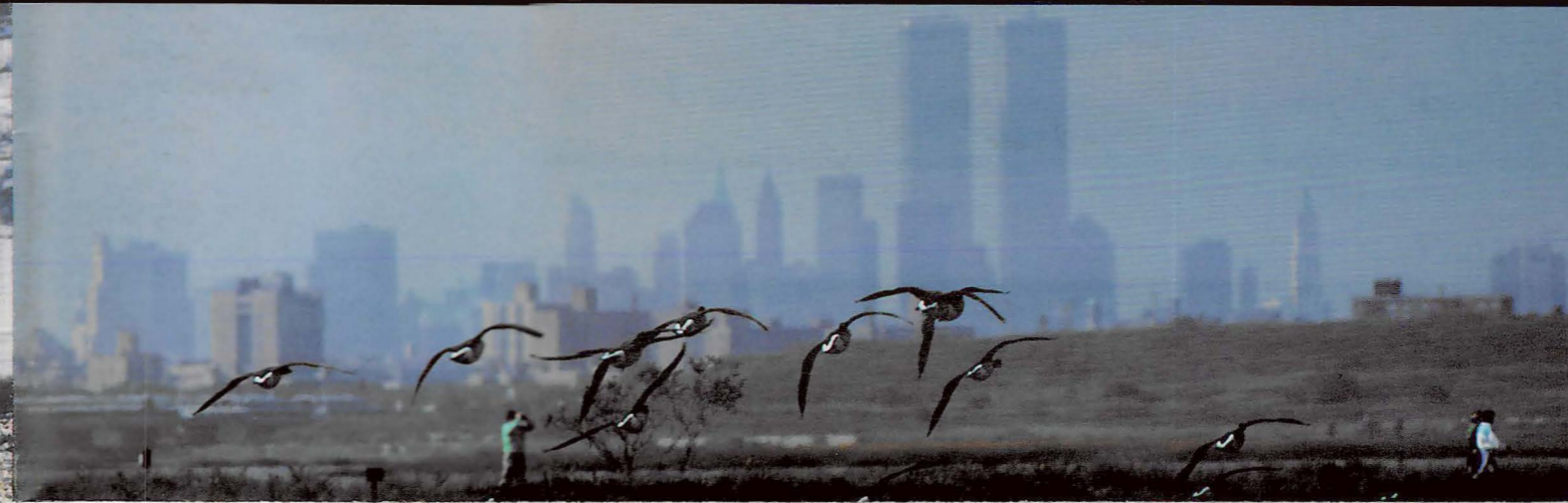
Canada geese, Gateway National Recreation Area.