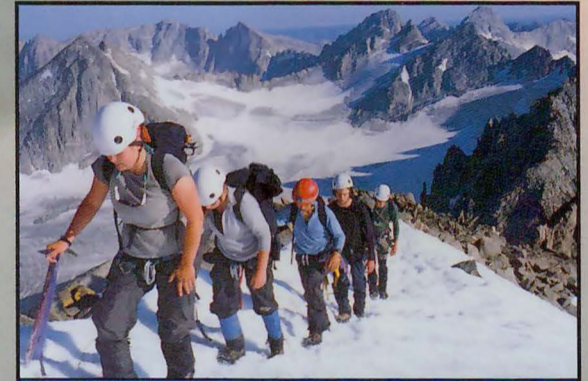
Bridger & Fitzpatrick Wildernesses, WY