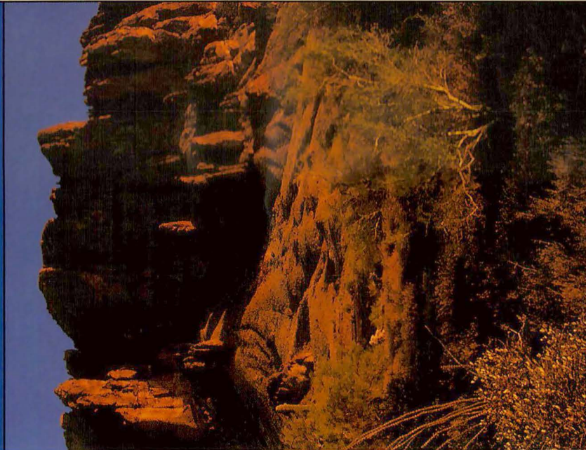
Superstition Wilderness, Arizona