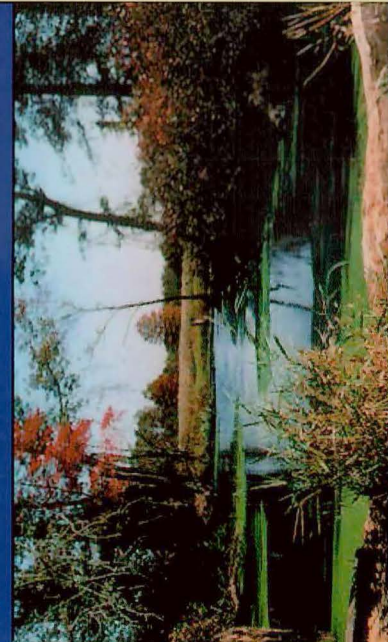
Great Swamp Wilderness, New Jersey