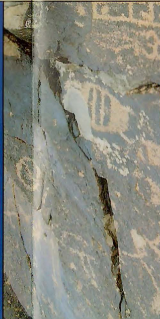
North McCullough Wilderness, Nevada