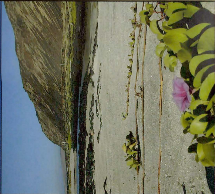
Hawaii Volcanoes Wilderness, Hawaii