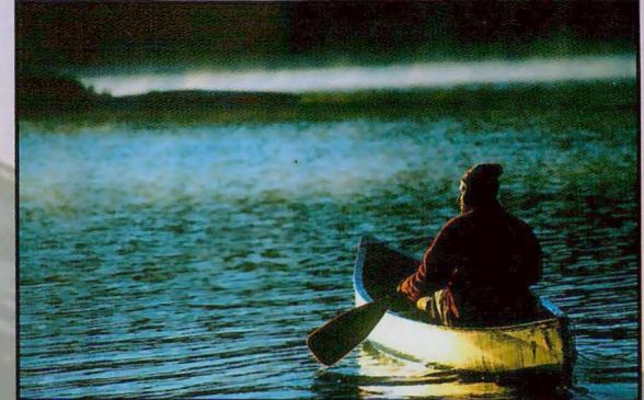
Boundary Waters Canoe Area Wilderness, MN

Legacy —Americans from all walks of life value the wilderness legacy. This legacy is passed on from generation to generation by many who will never visit wilderness, yet value its undisturbed quality. Failure to preserve the untrammeled and natural conditions of these areas threatens this legacy. Preserving wilderness character preserves our wilderness legacy.