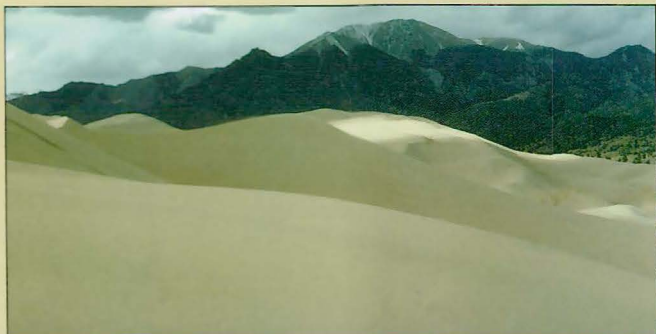
Great Sand Dunes & Sangre de Cristo Wildernesses, CO

The NPS manages 41% of America's wilderness acreage.