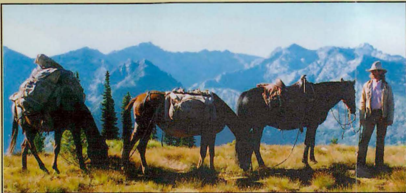
Selway-Bitterroot Wilderness, Idaho & Montana

"Those who contemplate the beauty of the earth find reserves of strength that will endure as long as life lasts... There is something infinitely healing in the repeated refrains of nature—the assurance that dawn comes after night, and spring after the winter. The lasting pleasures of contact with the natural world are not reserved for scientists but are available to anyone who will place himself under the influence of earth, sea, and sky, and their amazing life."