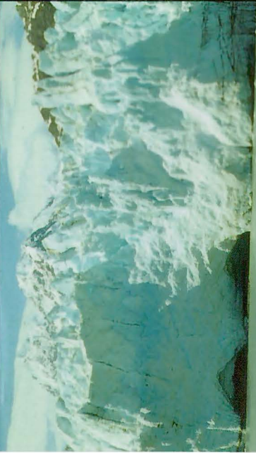
Glacier Bay Wilderness, Alaska