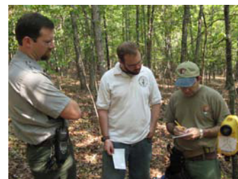
(Above) Natural resource managers and staff with the Mid-Atlantic I&M Network conduct forest vegetation monitoring at Fredericksburg & Spotsylvania National Military Park.

For the first time in the history of the National Park Service, all parks with significant natural resources now have in place the minimum staffing, funding, and data systems to routinely collect, manage, analyze and report long-term data for a modest set of vital signs, and to effectively deliver data and information on resource condition to park managers, planners, and other key audiences. As a direct result of the efficiencies gained through the network approach, all parks with significant natural resources have identified their vital signs, and the majority of parks can now provide “current condition” estimates for key measurements of the condition of high-priority natural resources.