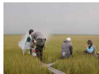
(Below) Scientists from the USGS and Fire Island National Seashore collect Sediment Elevation Table (SET) data as part of the Northeast Coastal and Barrier I&M Network's salt marsh monitoring program.

Three key aspects of the I&M strategy are the leveraging of resources and expertise through integration and collaboration with other NPS programs and agencies; an interdisciplinary approach to compiling, analyzing, and reporting natural resource information; and an explicit link to park management and planning.