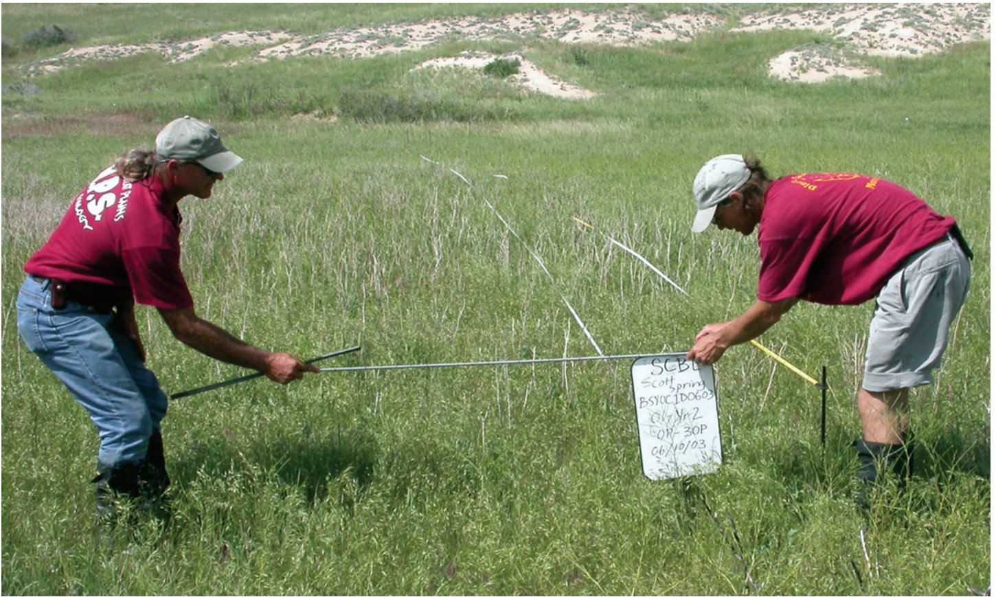
Scientists with the Heartland Monitoring Network conduct vegetation monitoring at Scotts Bluff National Monument, Nebraska.