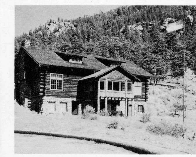
Moraine Park Museum

An active program of guided field trips, informal nature walks, and illustrated evening talks is provided the visitor from late in June until early September. These free services are designed to help the visitor enjoy his park through an increased understanding of its story and significance. Schedules of the week's activities are available during the season.