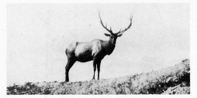
American Bull Elk

the park, via Grand Lake, over U. S. No. 34 from its junction with U.S. No. 40 near Granby.