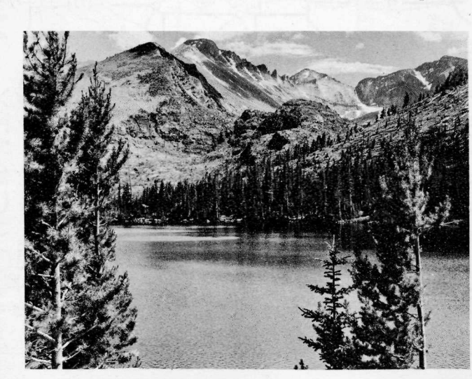
Bear Lake and the Front Range

Numerous hotels, lodges, and camps are located on private lands in or adjacent to the national park. Further information may be obtained by directing inquiries