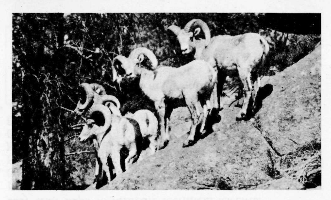
Rocky Mountain Bighorn

synopsis is for your general guidance. Complete regulations may be seen at the office of the superintendent and at ranger stations. Violators of park rules and regulations are given hearings before the United States