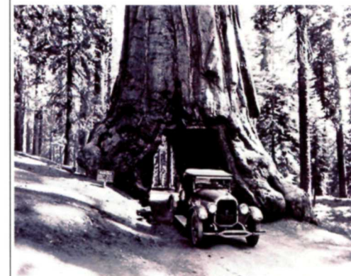
The Wawona Tunnel Tree, Yosemite National Park, 1929.

Borrowing privileges and full library services are extended to all NPS employees stationed in the Pacific West Region.