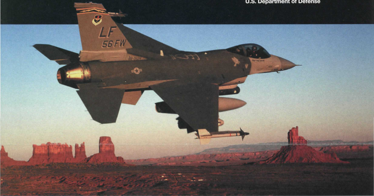
F-16C Fighting Falcon over Monument Valley Navajo Tribal Lands, Arizona (near Glen Canyon National Recreation Area).

United States Air Force U.S. Department of Defense