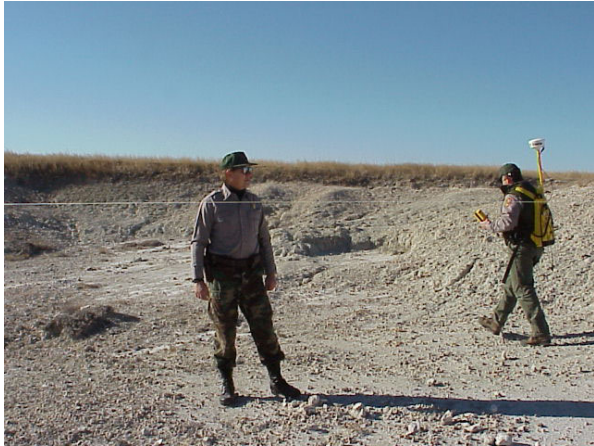
Documenting a fossil locality at Badlands National Park, SD.