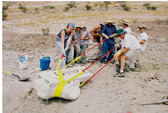
Excavating a dinosaur at Big Bend National Park, TX.