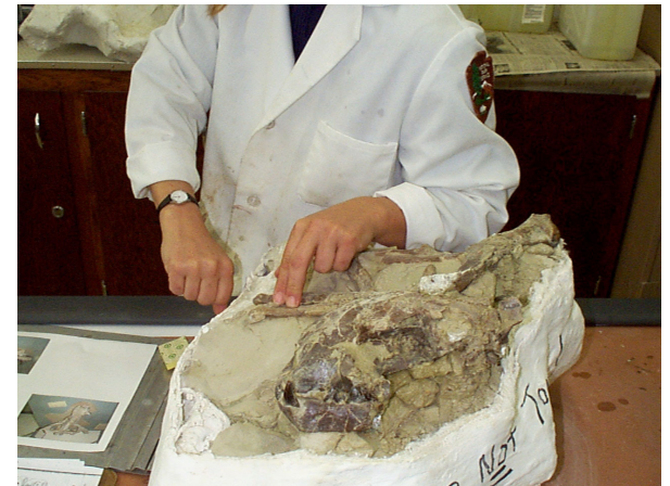
Preparing an extinct sabertooth cat at John Day Fossil Beds National Monument, OR.

The NPS Paleontology Program produces a series of paleontology publications (e.g., Paleontologic Research Volumes, Park Paleontology Newsletters, Park Paleontologic Surveys) that are available to the general public as well as parks and professionals. See our website for availability.