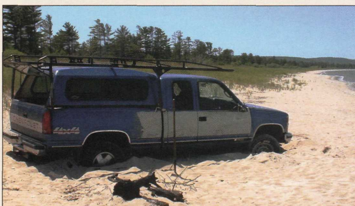
Only drive in legal ORV areas unless lots of shoveling and paying a fine are on your list of “things to do.” Off-road driving is illegal at Sleeping Bear Dunes National Lakeshore, Michigan.