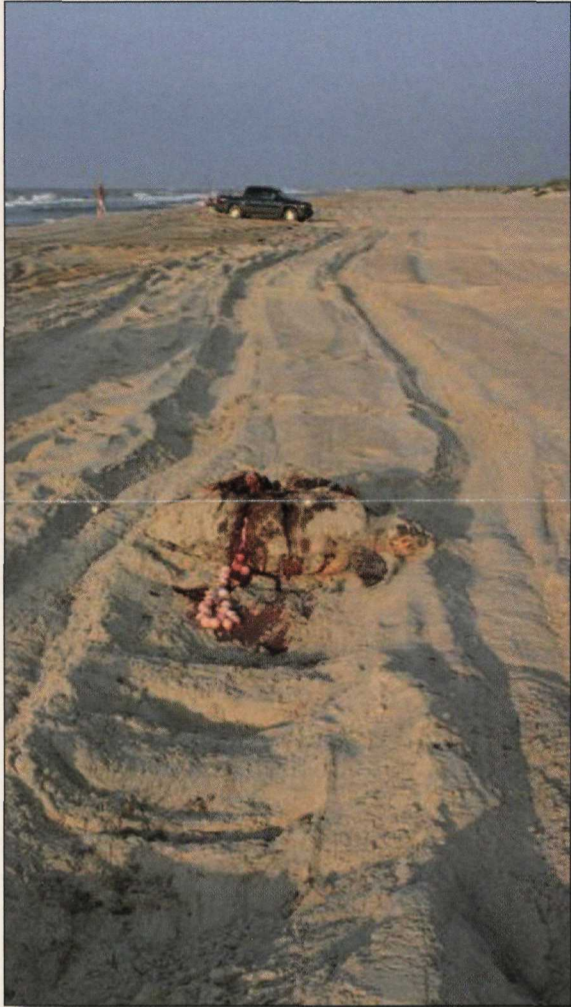
This female loggerhead turtle, listed as a threatened species, was attempting to nest when it was crushed and killed by an ORV operating illegally. ORV use in protected areas could harm or reduce local populations of threatened or endangered species. Cape Hatteras National Seashore, North Carolina.