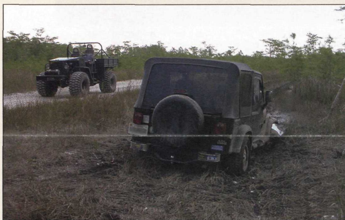
Both of these vehicles at Big Cypress National Preserve, Florida, are considered ORVs. The vehicle on the left is operating legally on the designated trail; the vehicle on the right is not.