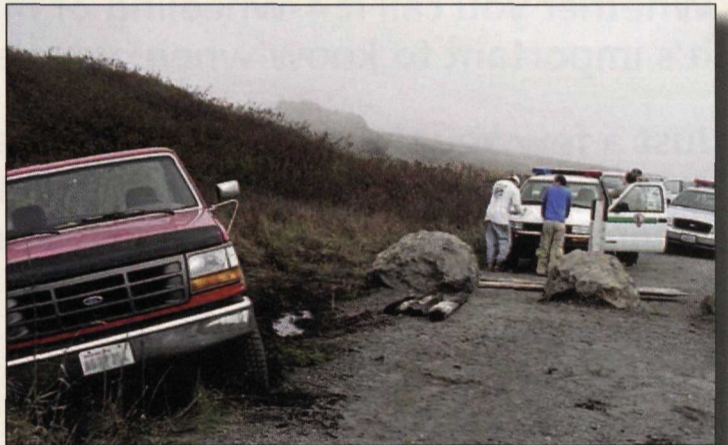
Driving around barricades and in areas closed to ORVs causes erosion, which kills plants and destroys beach dunes. San Juan Island National Historical Park, Washington.