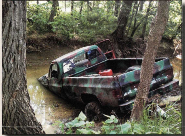
Don't get in over your head. Fluids leaked from ORVs poison fish and other animals that rely on rivers and streams. Ozark National Scenic Riverways, Missouri.