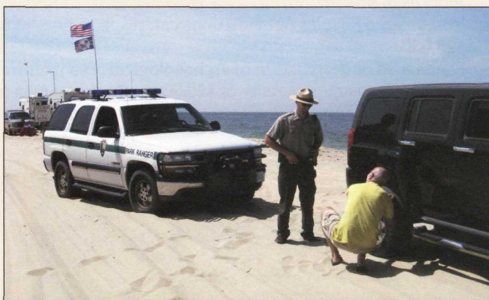
National park rangers perform vehicle safety checks and enforce off-road driving regulations. Cape Cod National Seashore, Massachusetts.