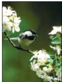
Black-capped chickadee, Myles Willard