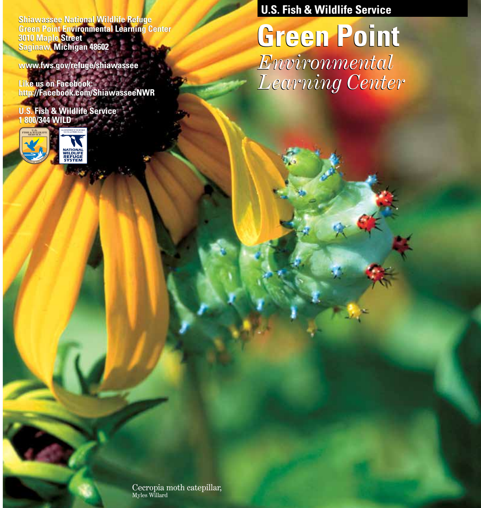
Cecropia moth caterpillar; Myles Willard