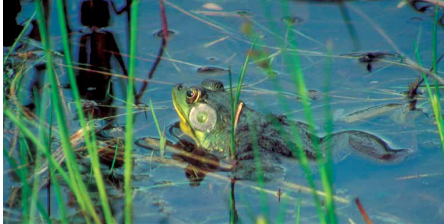
Green frog, Myles Willard