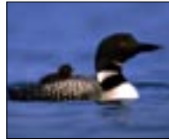
Loon and Chick

At Seney, the trumpeter swan is a true success story. In 1991 and 1992 captive-reared swans were released. Excellent habitat and food sources have allowed the swans to flourish. Today trumpeter swans, the largest North American waterfowl, are a common sight on the refuge.