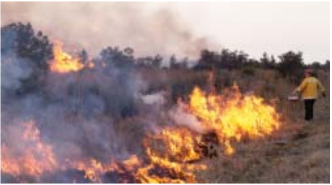
Habitat management through prescribed burning