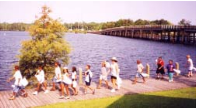
School group on Scuppernong River Interpretive Boardwalk behind the Walter B. Jones, Sr. Center for the Sounds

fields and moist soil units and returning to the lake at dusk. The black color of the water in the lake is caused by tannins and particles from peat soil and native vegetation. Since the dark water does not allow light penetration, there is no submerged aquatic vegetation found in Pungo Lake. Pungo Lake is also used as a site to catch and band waterfowl. The banding program is used to gather information and data to manage the birds throughout the flyway.