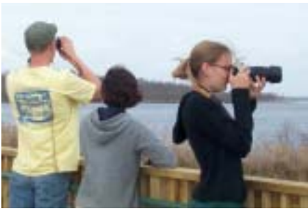
Observation on Pungo Lake

Wildlife Observation Early mornings and late afternoons are the best times to observe wildlife. Bear and deer can often be observed along refuge roads or