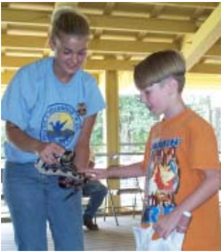
YCC student teaches a visitor about wildlife on the refuge.

Lake banding site, Jones Dike, Shepard's Dike, the Riders Creek banding site, and the Dunbar Road banding site are closed to all public entry from November 1 through the last day of February annually. The Pungo Unit is closed to all public entry,