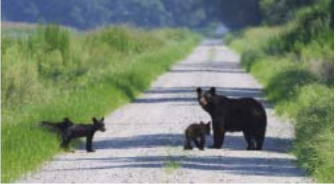
Black bear with cubs

refuge, a few are the American alligator (North Carolina is its most northern range), snapping turtle, yellowbelly slider, slender glass lizard, cottonmouth snake, copperhead snake, and the pigmy rattlesnake.