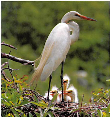
Great egret

The blue goose is the symbol for the National Wildlife Refuge System.