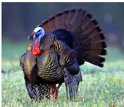
eastern wild turkey