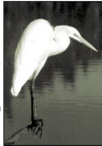
great white heron

The refuge protects habitat for a wide variety of birds including nesting and/or wintering populations of terns, frigate birds, white-crowned pigeons, ospreys, and great white herons. Also, the sandy beaches are nesting habitat for the endangered Atlantic green and loggerhead sea turtles. The refuge was established by Theodore Roosevelt in 1908 to curtail the slaughter of birds whose feathers were highly valued in the clothing industry. Wading birds were threatened with extinction before this refuge began providing a safe haven for them and other threatened plant and animals species.