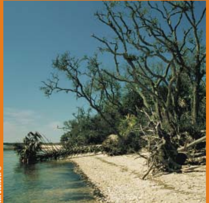
Ken Sourbeer ©

Refuge Manager Cedar Keys National Wildlife Refuge 16450 NW 31st Place Chiefland, FL 32626 352/493 0238