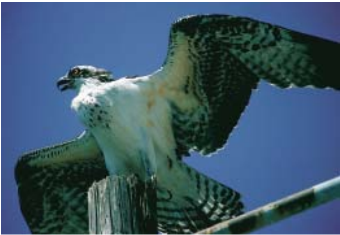
Bruce Colin ©