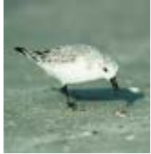
Bruce Collin ©