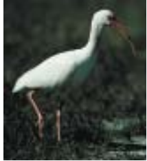
Bruce Collin ©

Access to the refuge is by boat only. All of the islands are surrounded by shallow sand, mud and grass flats which make them relatively inaccessible. At low tide, few sites along the shore can be reached by boat.