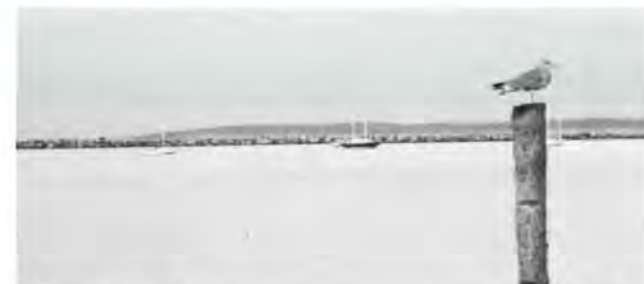
Fire Island Natl. Seashore

Address: Box 78, Put-in-Bay, Ohio 43456.