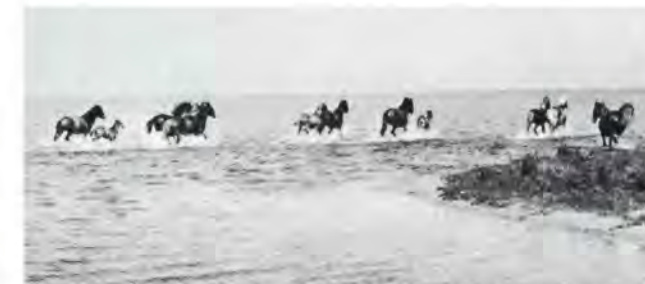
Assateague Island Natl. Seashore

Address: The Society of the Friends of Touro Synagogue, 85 Touro St., Newport, R.I. 02840.