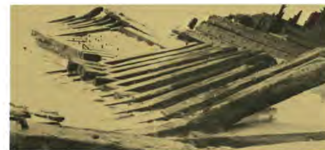
Fire Island Natl. Seashore