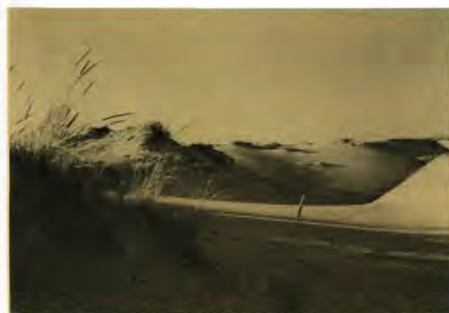
Cape Cod Natl. Seashore

Address: c/o Fire Island National Seashore and New York City NPS Group, 28 East 20th St., New York, N.Y. 10003.