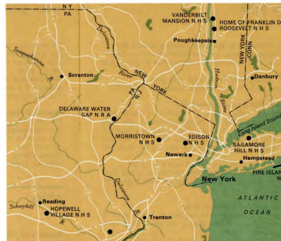
NEW YORK-NEW JERSEY AREA