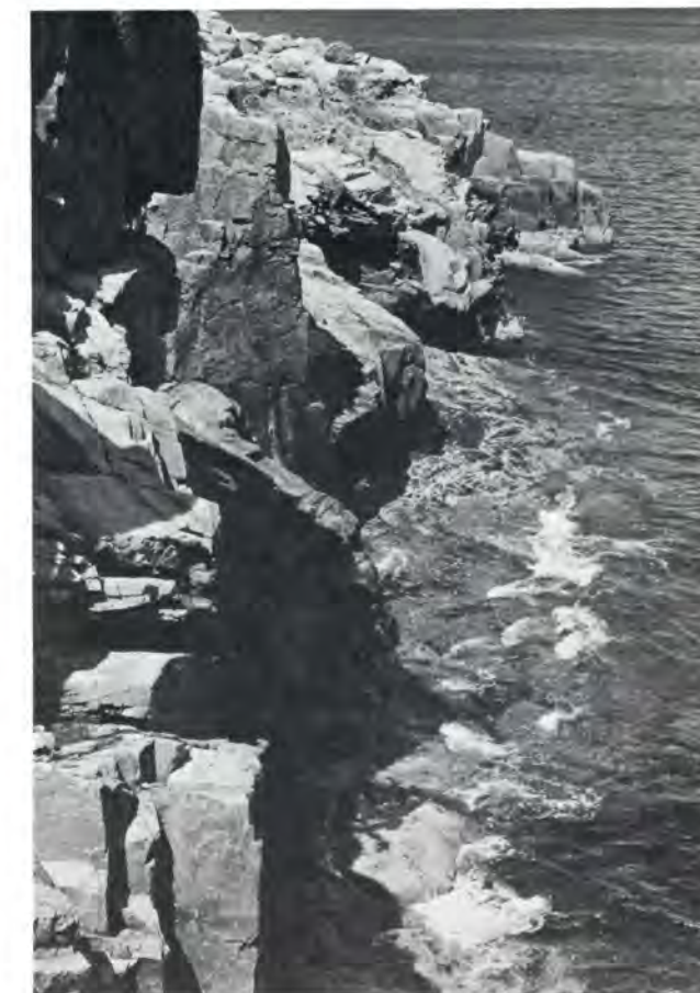
Acadia Natl. Park

Address: Box 759, Morristown, N. J. 07960.