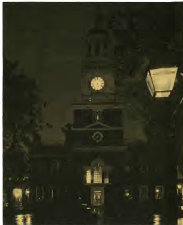
Independence Natl. Historical Park