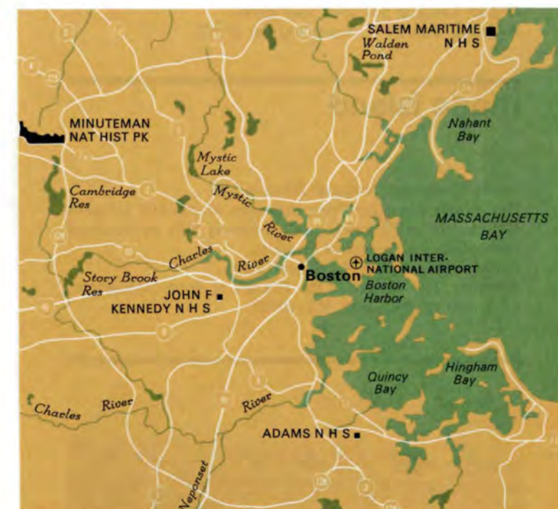
BOSTON AND VICINITY