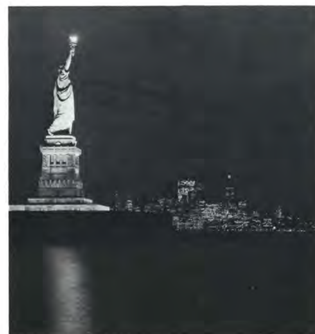
Statue of Liberty Natl. Monument

Address: c/o Superintendent, Fort McHenry National Monument and Historic Shrine, Baltimore, Md. 21230.