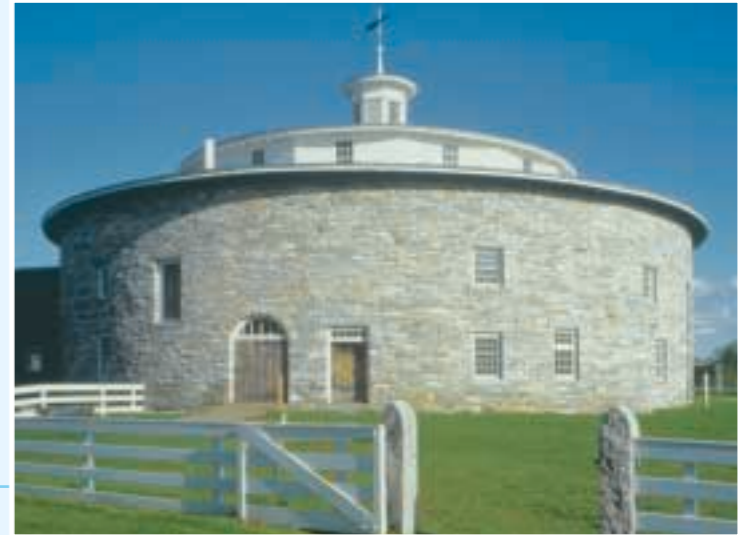
Shaker barn, Hancock, MA—Hancock Shaker Village

Regions use heritage areas for educating residents and visitors about the region, protecting its natural and cultural heritage, and enhancing the economy through business investment, job expansion, and tourism. Nonprofit organizations are primarily responsible for managing heritage areas. Heritage areas do not have land-use regulatory powers.