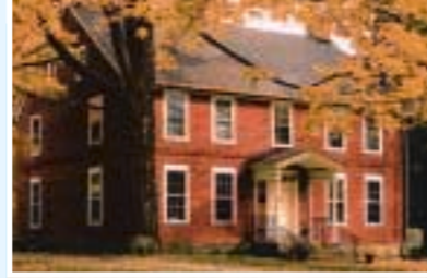
Gay-Hoyt House Museum, Sharon, CT

Heritage areas may be developed around a common theme or industry that influenced the culture and history of the region. In the Blackstone River Valley National Heritage Corridor, for example, the water-power-driven mills