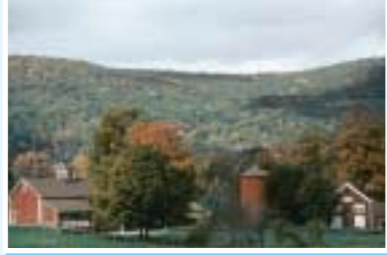
Farm in Kent, CT

A national heritage area has a distinctive history and geography, nationally important resources, and a story of broad interest to tell. The United States Congress officially designates national heritage areas and funds them through the National Park Service budget. There are 23 designated heritage areas. Though the National Park Service provides