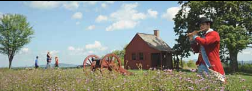
Visitors during a reenactment at Saratoga National Historical Park.

A 29-mile loop linking Saratoga Springs and the Saratoga National Historical Park.