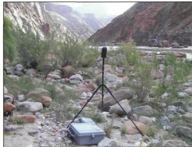
Acoustic monitoring equipment in Grand Canyon National Park.

The mission of the Natural Sounds Program is “...to protect, maintain, or restore acoustical environments throughout the National Park System. We fulfill this mission by working in partnership with parks and others to increase scientific and public understanding of the value and character of soundscapes and to eliminate or minimize noise intrusions.”