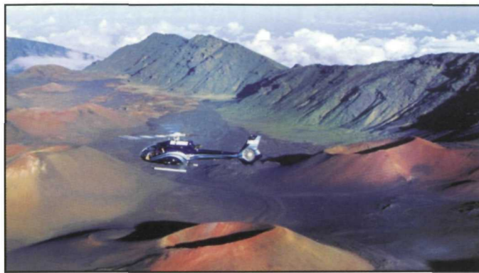
Helicopter flying over Haleakala National Park. The NPS Natural Sounds Program works with the Federal Aviation Administration to develop Air Tour Management Plans in national parks where commercial air tours operate.

In a survey of the American public, 95% of participants felt that experiencing natural peace and the sounds of nature were important reasons to preserve national parks.