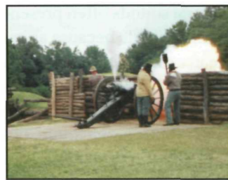
Cannon firing demonstration at Vicksburg National Military Park.