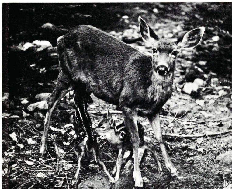
A sanctuary for wildlife.

You can easily identify the true firs by their erect cones, which disintegrate at maturity. Other cone-bearing species have pendant cones which do not break up when ripe.