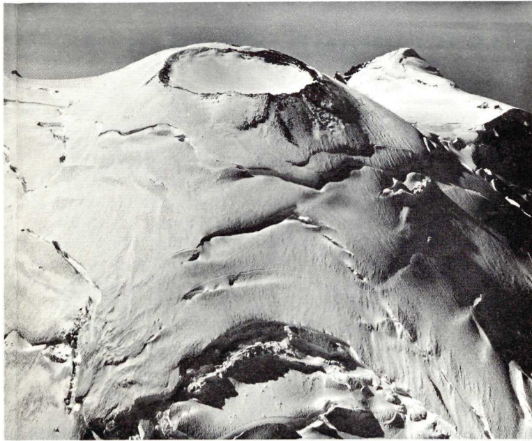
Aerial view of summit crater showing ice cap and crevasses.

The effects of altitude and habitat are reflected as definitely, but less conspicuously, in tree growth. Lowland forest, penetrating the park in the largest river valleys, reaches its upper limits around 3,000 feet. These dense, cathedral-like forests have some trees of great size. The lowland forest contains principally Douglas-fir, western hemlock, and western redcedar. Grand fir grows up the valleys to about 2,500 feet; above, it is replaced by Pacific Silver fir and noble fir.