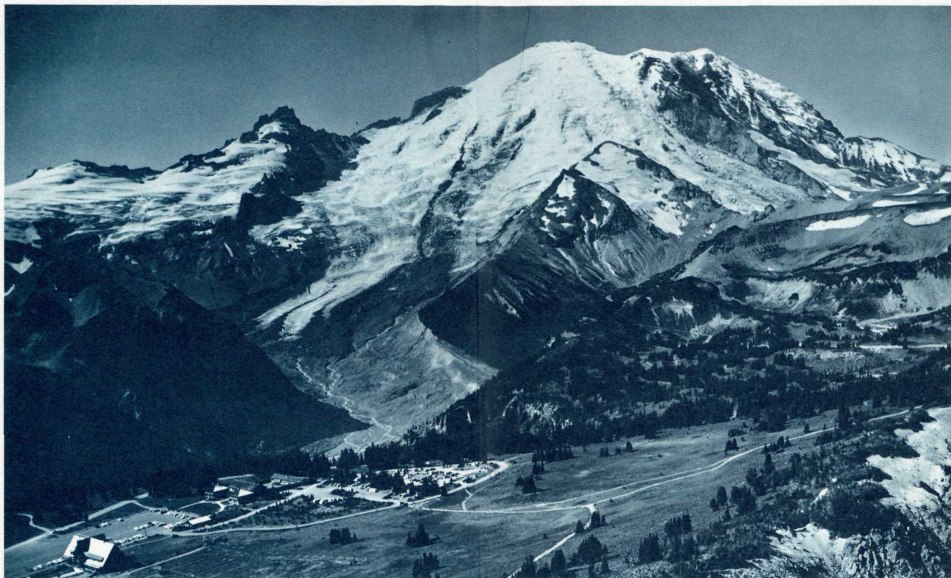
Emmons Glacier above Sunrise.

The park's 378 square miles extend from Mount Rainier eastward to the Cascade Range crest.