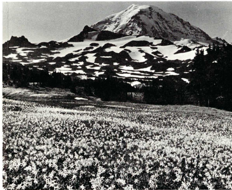
Mount Rainier's flower meadows—famous throughout the world.