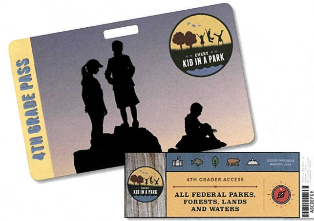
The pass (top) or paper voucher (bottom) allows fee-free entry.

By participating in the Every Kid in a Park program, you can visit and learn about your federal lands and waters right now. Ignite a passion for history and culture and spark a lifelong commitment to saving places that matter. Learn about opportunities for classroom activities or ways to become involved in protecting these special places.