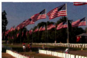
Andersonville National Cemetery

You can find a list of participating parks at http://www.nps.gov/stri/forkids/jcwh.htm .