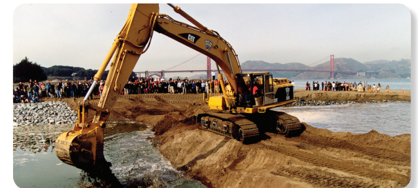
Golden Gate National Recreation Area, California.

An inventory of coastal engineering projects completed in coastal parks is being compiled to help the NPS identify impacts to coastal processes and improve resource protection in the future. A pilot project has been completed for ten coastal parks. Results from this project are available online at: www.nature.nps.gov/geology/coastal/storms.cfm