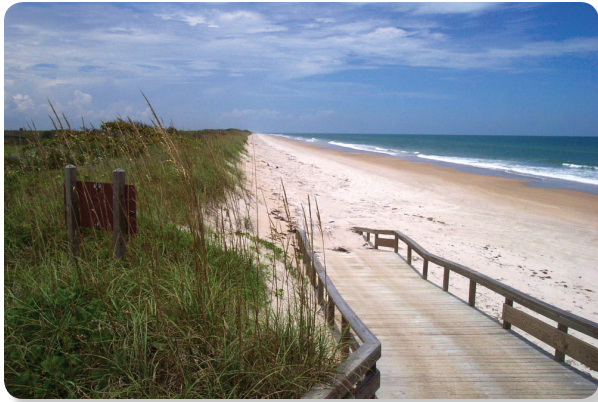
Canaveral National Seashore, Florida