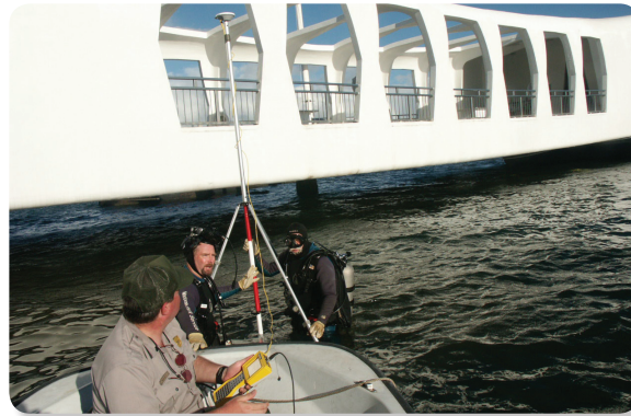
Submerged Resource Center divers at the USS Arizona Memorial, Hawaii.

Research greatly benefits coastal park managers by providing them with information necessary to protect and preserve coastal resources. If you are interested in conducting research in the National Parks, or establishing collaborative studies, visit: www.nature.nps.gov/geology/publications/research_factsheet.pdf or contact the natural resource manager for the park.