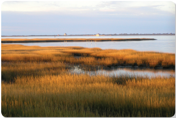
Assateague Island National Seashore, Virginia.