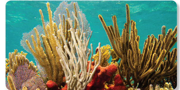
Biscayne National Park, Florida.

Climate variability and change are already affecting coastal parks through rising sea level, lowering Great Lakes water levels, increasing ocean acidity, and melting permafrost. The NPS is harnessing best-available science to develop landscape- and ecosystem-scale coastal adaptation strategies to protect coastal resources and promote their long-term resilience and sustainability.