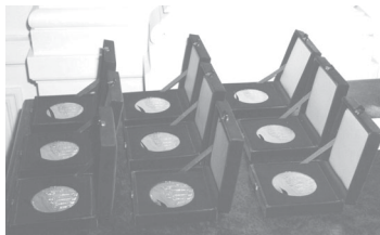
Congressional Gold Medals of the Little Rock Nine.