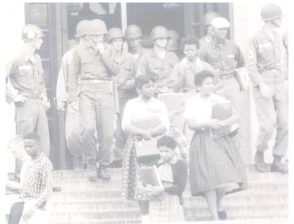
Some of the Little Rock Nine leave Central High under troop escort.

By the end of the 1957-58 school year, the Little Rock Nine had earned the right to be called Central High Students.