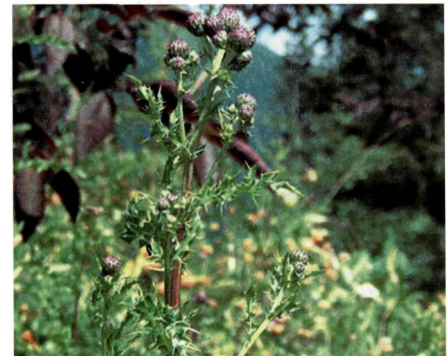
Canada thistle, a prickly threat that is rapidly spreading in Alaska