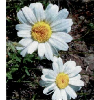
Oxeye daisy, pretty flowers with a bad reputation

Oxeye daisy ( Leucanthemum vulgare ) seems like an innocuous wildflower and is often included in seed mixes, but it is actually a weed that can invade natural habitats. It easily escapes cultivation, out-competing and displacing native species. The entire plant has a disagreeable odor