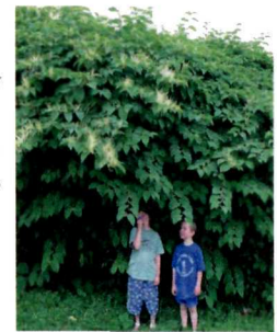
Enormous Japanese knotweed

Japanese knotweed ( Polygonum cuspidatum ) forms single-species stands that reduce biodiversity by outshading native vegetation. It also clogs waterways and spreads easily upstream and downstream, lowering the quality of wildlife and fish habitat and reducing the food supply for juvenile salmon. Japanese knotweed occurs in Sitka National Historical Park.