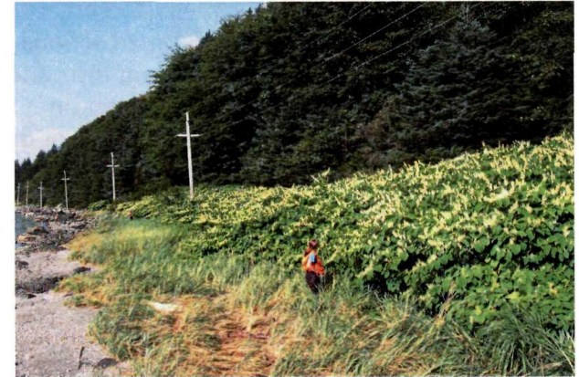
A large Japanese knotweed infestation on a beachfront near Juneau