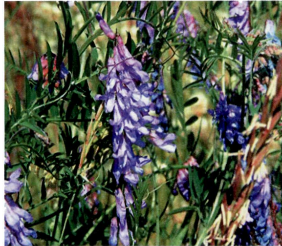
Bird vetch climbs over native vegetation along a roadside in southcentral Alaska.

Bird vetch ( Vicia cracca ) aggressively climbs fencing, trees, bushes and other vegetation, monopolizing sunlight, space and moisture. This characteristic has given it the nickname, "Alaskan kudzu." It spreads along roadsides and trails and can invade natural areas and alter soil nutrient levels. This plant has formed large infestations in Anchorage and Fairbanks, and small patches have been found in Denali National Park and Preserve and Yukon-Charley Rivers National Preserve.