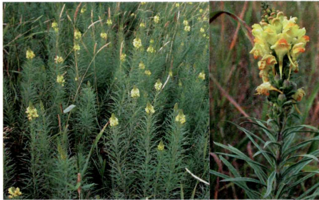
Yellow toadflax's bicolor flower is easy to identify, while the plant is difficult to control.

The terms exotic, introduced, alien and non-native are frequently used interchangeably with the term invasive. Six invasive plants in Alaska's National Parks include: