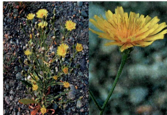
Hawkbeard resembles dandelion but has smaller flowerheads and narrower leaves.

Narrowleaf hawkbeard ( Crepis tectorum ) is a weed of agricultural fields, pastures, roadsides and waste areas. It can out-compete native Alaskan plants and is spreading rapidly around the state. Narrowleaf hawkbeard smothers disturbed areas in Denali National Park and Preserve and has been recently found in Wrangell-St. Elias National Park and Preserve, Lake Clark National Park and Preserve, and Klondike Gold Rush National Historic Park.